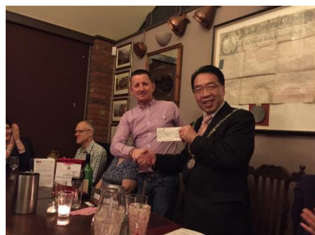
Cheque Presented to the Mayor

Local Government Funding. Following cuts in Government funding, St Edmundsbury Borough Council voted on 23 rd February to pass a 1.95 per cent increase in its portion of council tax, the first increase in 6 years. The Borough Council's tax increase equates to £3.42 (7p a week) for the average household, and was combined with rises in the county council, police and town council precepts to add up to an increase of more than £30 in the average family's tax. Borough Council cuts to Parish Council funding resulted in an increase to the Parish precept with a Property Band D attracting a charge of £59.16, an increase of 6.8%.