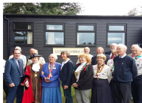
Lunney Lodge Ceremony Guests