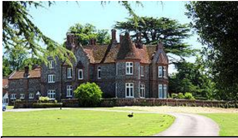
Bradfield Hall Today

The present Grade II Listed Hall was built of brick and flint in 1857 alongside the original moated site from where the original tree-lined avenue runs down to the village All Saints Church where Arthur Young's tomb, a national monument, can be found.